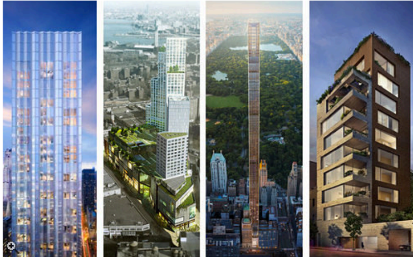
[From left: Norman Foster's 100 East 53rd Street, COOKFOX's City Tower, SHoP's 111 West 57th Street, and Isay Weinfeld's Jardim.]

Tuesday, September 8, 2015, by Curbed Staff